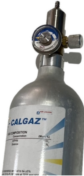
Step 3. Installed the Regulator to the Gas cylinder