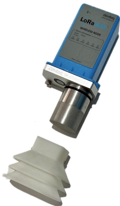
Step 2. Insert rain guard to the sensor filter and tighten the locking screws