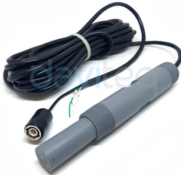
PROCESS PH FLAT SENSOR WITH TEMPERATURE COMPENSATION MBRTU-PHFLAT