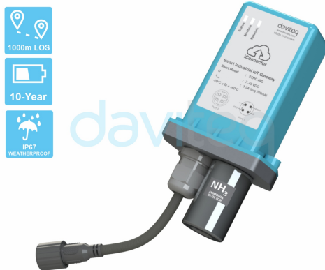
AMMONIA GAS SENSOR WITH 3G CONNECTIVITY SIAQ-3G-NH3