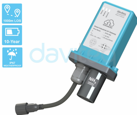
AMMONIA GAS SENSOR WITH 3G CONNECTIVITY SIAQ-3G-NH3