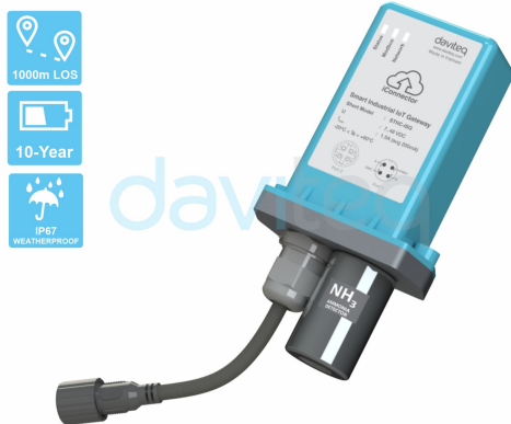
AMMONIA GAS SENSOR WITH 3G CONNECTIVITY SIAQ-3G-NH3