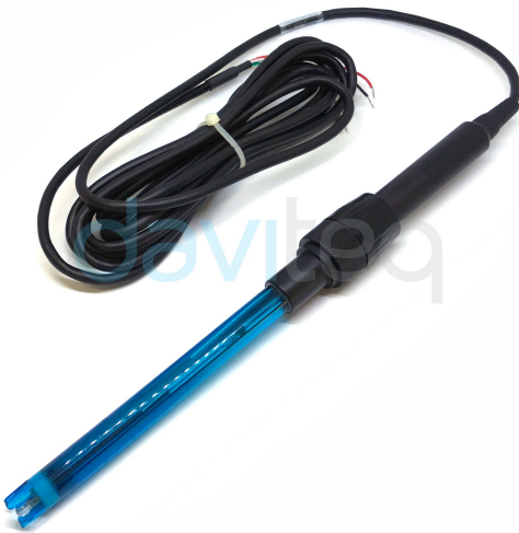
ECONOMY PH SENSOR WITH MODBUS OUTPUT MBRTU-PH-H035