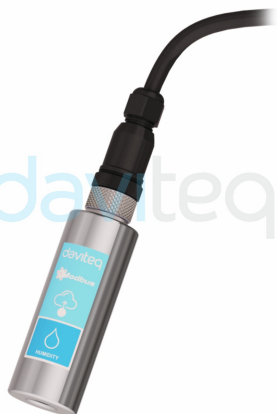
AMBIENT HUMIDITY & TEMPERATURE SENSOR WITH MODBUS OUTPUT MBRTU-ATH