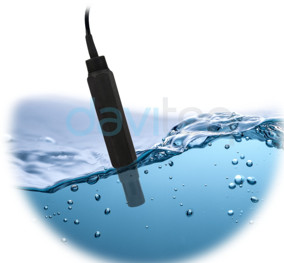
MEASURING DISSOLVED OXYGEN IN WATER