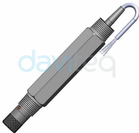
PROCESS OPTICAL DISSOLVED OXYGEN SENSOR MBRTU-PODO