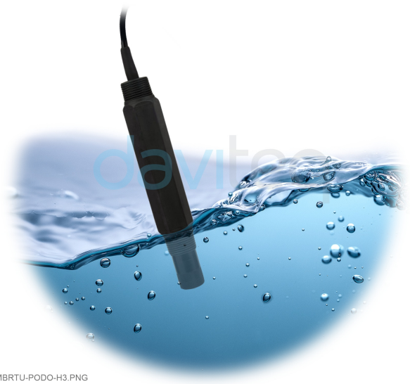
MEASURING DISSOLVED OXYGEN IN WATER