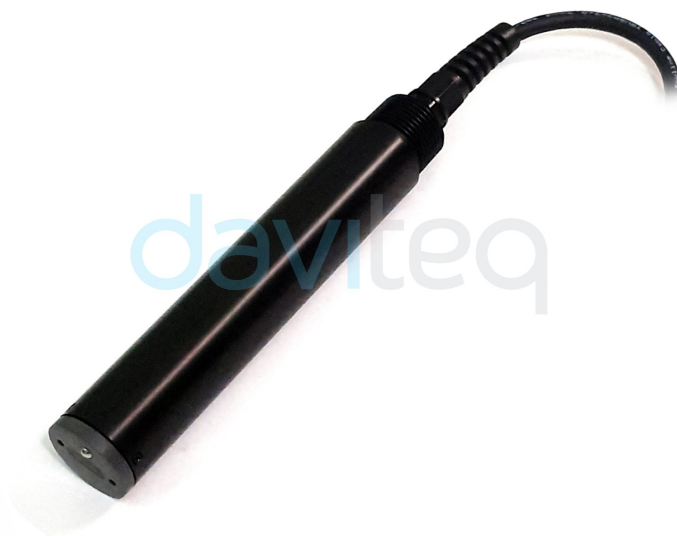
PROCESS TURBIDITY SENSOR WITH MODBUS OUTPUT MBRTU-TBD

MBRTU-TBD is an advanced digital turbidity sensor for water quality monitoring, adopt the principle of scattered light, the design method of using infrared LED light source and optical fiber conduction light path. The filter design is added inside, which has strong anti-interference ability. Built in temperature sensor, automatic temperature compensation, suitable for online long-term monitoring of the environment.